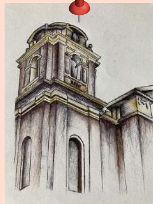
Mixed media drawing S. Bapary