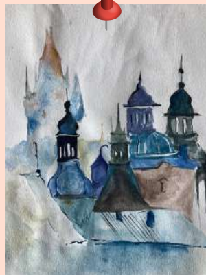
Watercolour on paper A. Shaikh