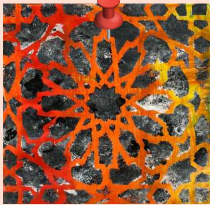
Mixed media stencil printing - Entwined Project N. Said Year 8