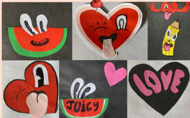
Hattie Stewart sticker designs - mixed media. Various students - Year 9