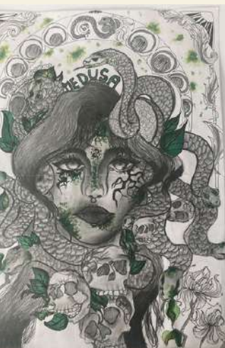
V. Pravin Year 9

From the sketchbook designs, to constructing 3D shapes, adding details and coloured glazes...Lots of hard work has ensured the cakes look good enough to eat!