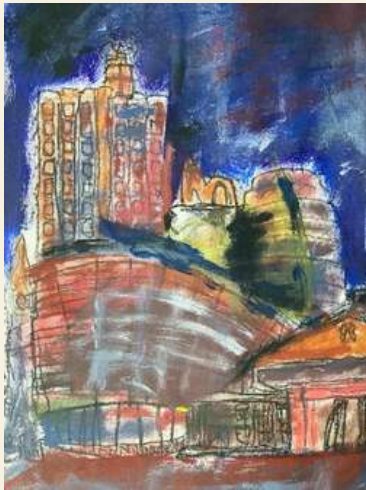
R. Mulla- 6 different Leicester landmark buildings, can you spot the Clocktower or Old John?