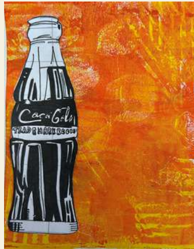
Year 9 mixed media responses combining Andy Warhol style drawings with textured backgrounds, made with gelli plate printing.