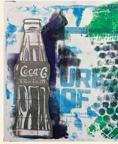
Year 9 mixed media responses combining Andy Warhol style drawings with textured backgrounds, made with gelli plate printing.