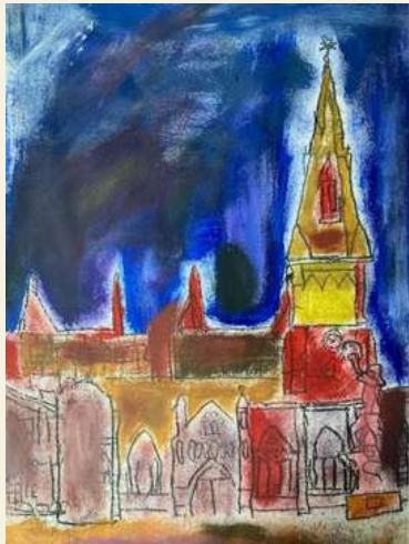
Z. Nurmamod- Leicester Cathedral, King Richard Statue and the King Power Stadium hiding in the background!